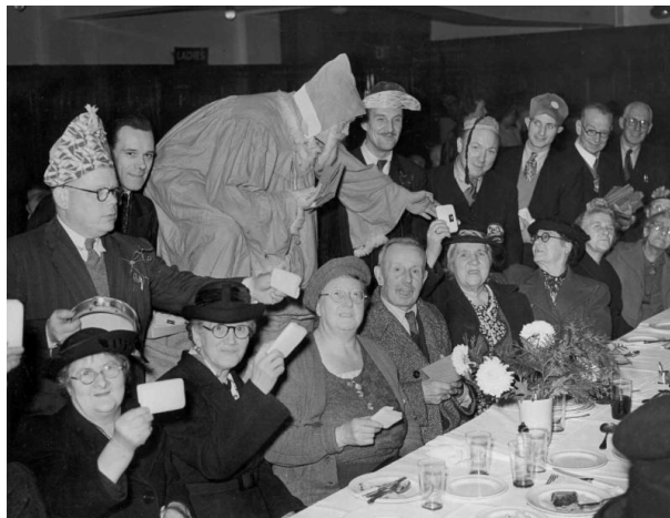
"Old folks" Christmas party at York Hall, Bethnal Green, 1949.

Please email your captions to localhistory@towerhamlets.gov.uk by 31st December 2013. The winning entry will receive a copy of "Good morning brothers!" by Jack Dash.