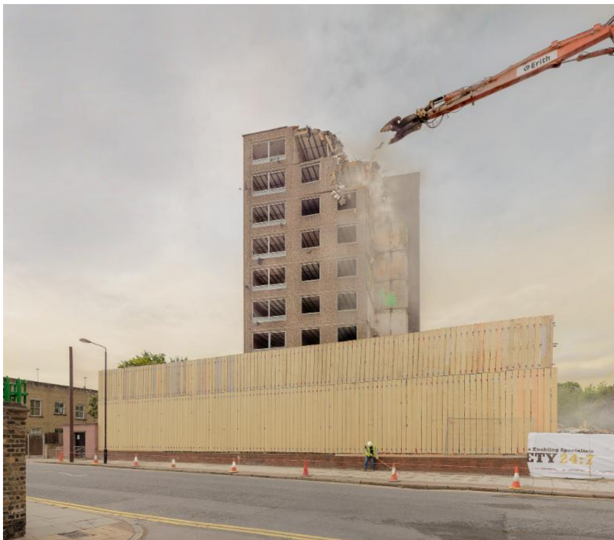
Ocean Estate, Stepney, 2015