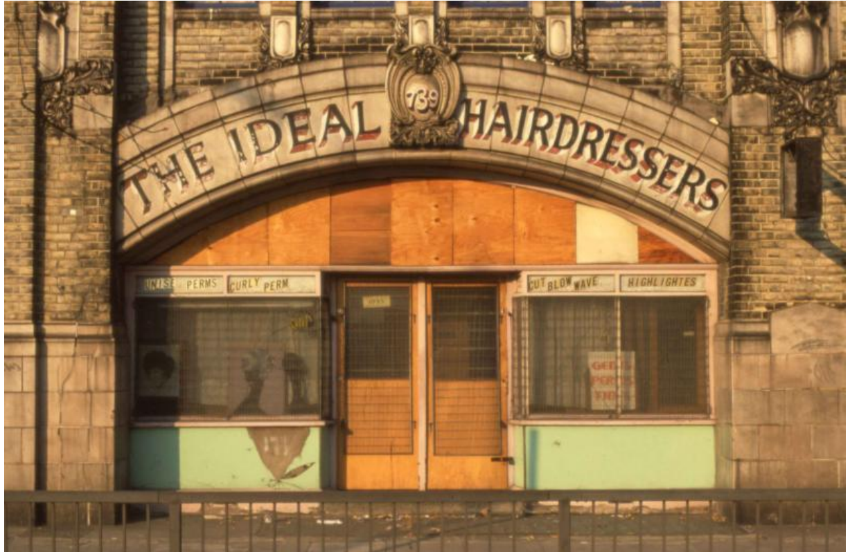
The Ideal Hairdressers, 739 Commercial Road, 1988, by Alan Dein