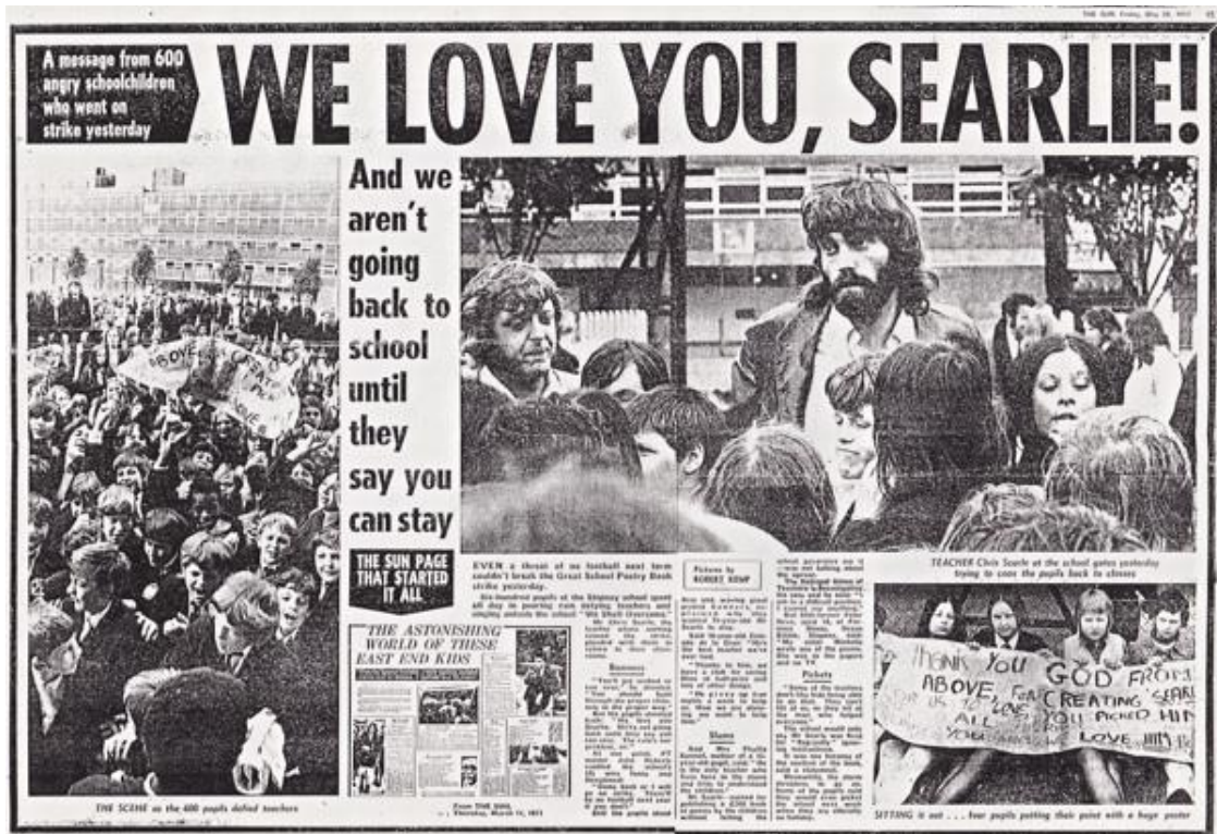
National press coverage for the Stepney school strike of 1971