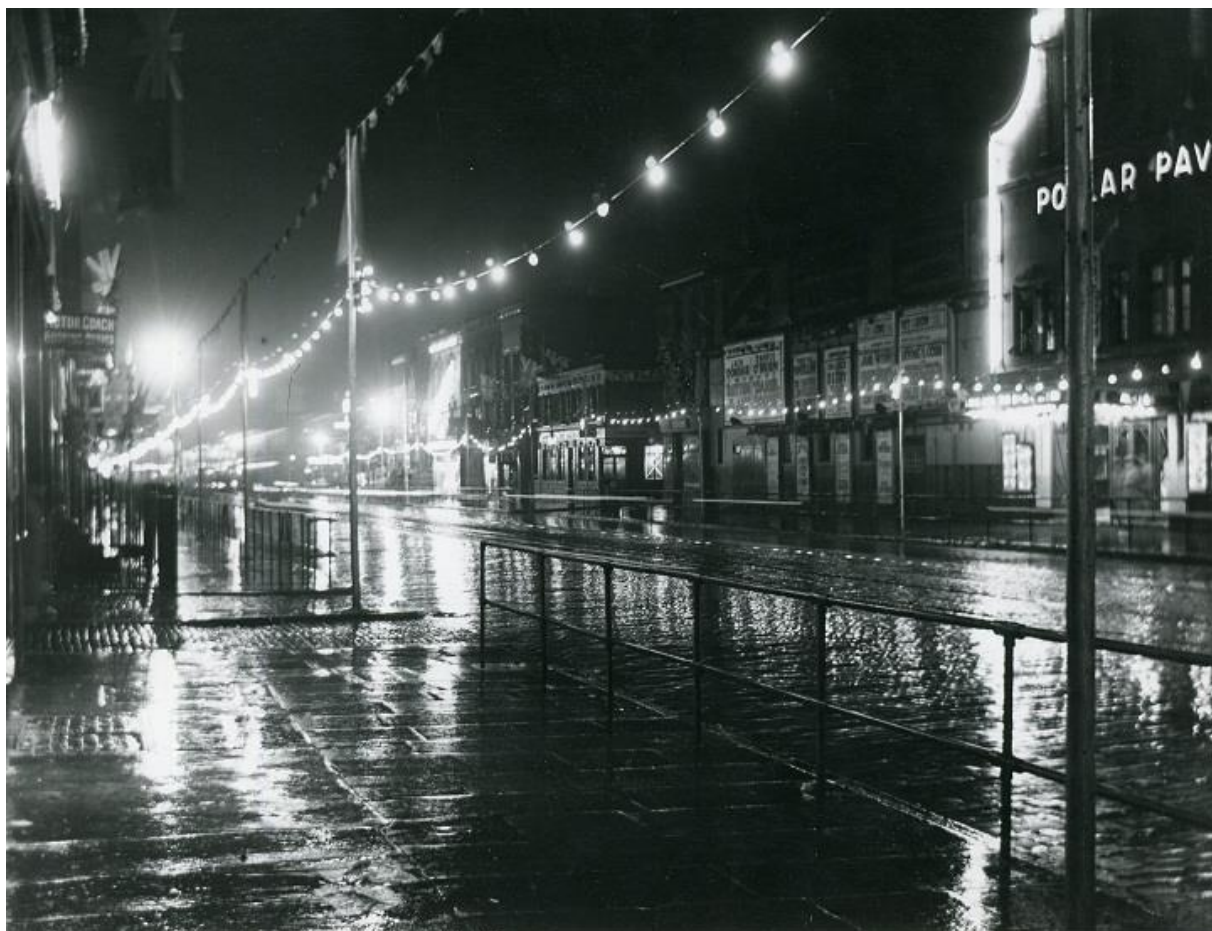
East India Dock Road, 1937 by William Whiffin