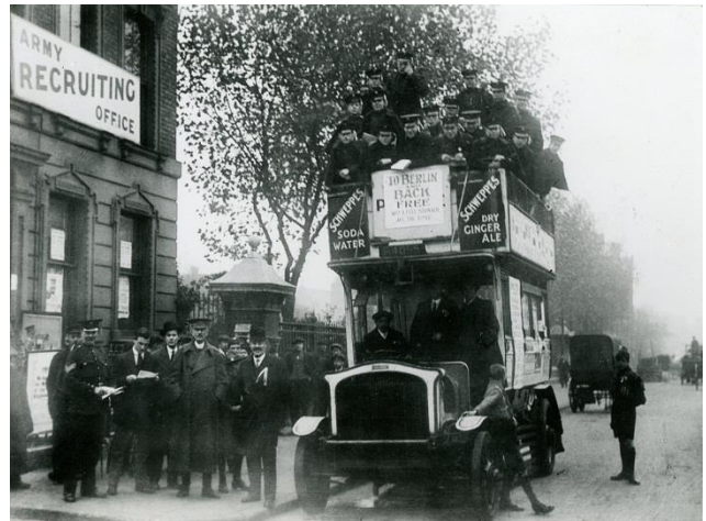
Poplar Army Recruiting Office, 1914