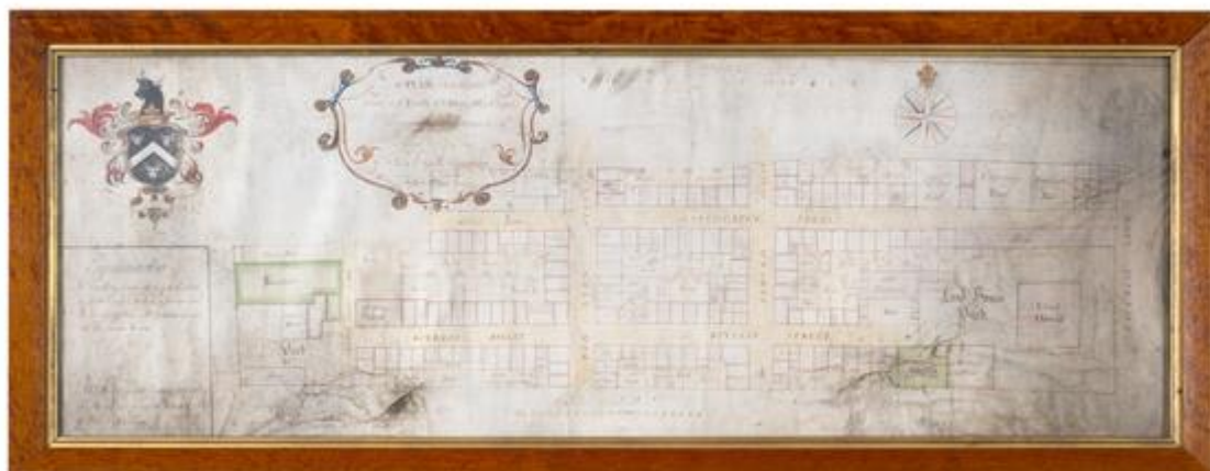
'A Plan of an Estate situate in the Parish of St Mary White Chapel belonging to Messrs. Buckleys Esqrs. Survey'd and Delineated by Joseph Manning, 1747'

We will sign off another bumper newsletter with details of a recent auction purchase. We're very pleased to have acquired for the public a unique hand-coloured plan of Whitechapel from 1747 which gives much detail on street layout and use of premises. This is now available to consult in our Reading Room (Ref: P/BUC/1 ). It is contemporaneous with the construction of the London Hospital, the building which is now our Town Hall, and documents the arrangement of a plot of land to its west, about 5 acres in size.