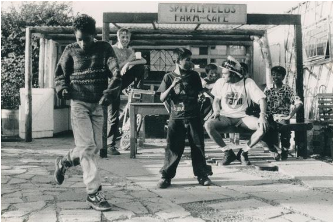
Photograph by Julie Begum, 1990s. Courtesy Bengali Photo Archive

Opening soon at Four Corners in Bethnal Green, I Am Who I Am Now: Selections from the Bengali Photo Archive offers a unique insight into the everyday life of the Bengali East End of London. The exhibition focuses on vernacular photographs taken of and by Bengali people over the past 50 years. Accompanied by oral histories and collaboratively produced archival interpretations, it offers a powerful and intimate perspective on the community's histories. From the microcosms of the family to the transformative power of community spaces, it illuminates the intricate interplay between individual experiences and the broader sociopolitical landscape in the East End.