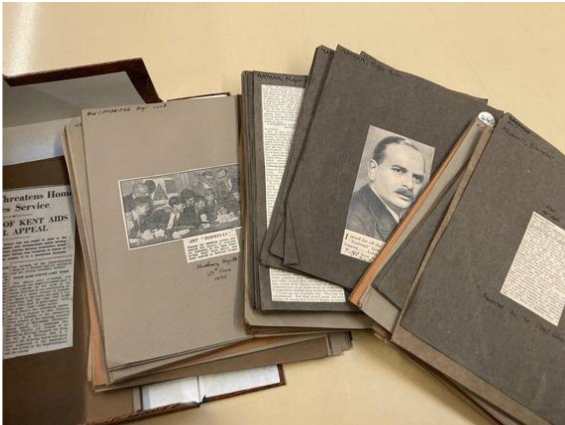
Examples from the Bethnal Green press cuttings collection