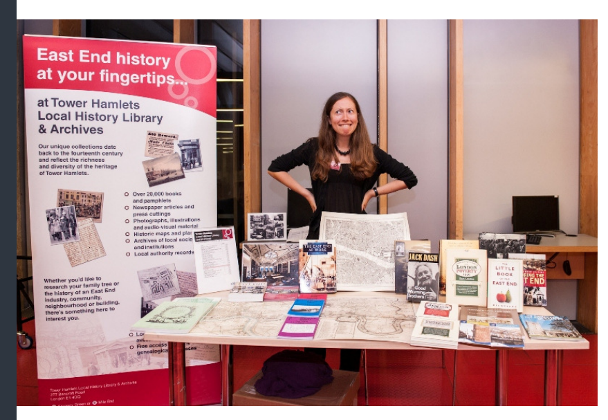
The Local History stall at David Long's 'Murderous London' Write Idea talk at Idea Store Whitechapel

The LHL&A team have enjoyed setting up camp at the many local history themed talks and discussions at this year's free Write Idea reading festival, programmed by Idea Store.