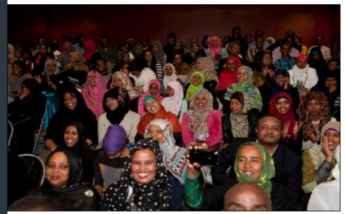
An appreciative audience at Somali Week Festival, Oxford House