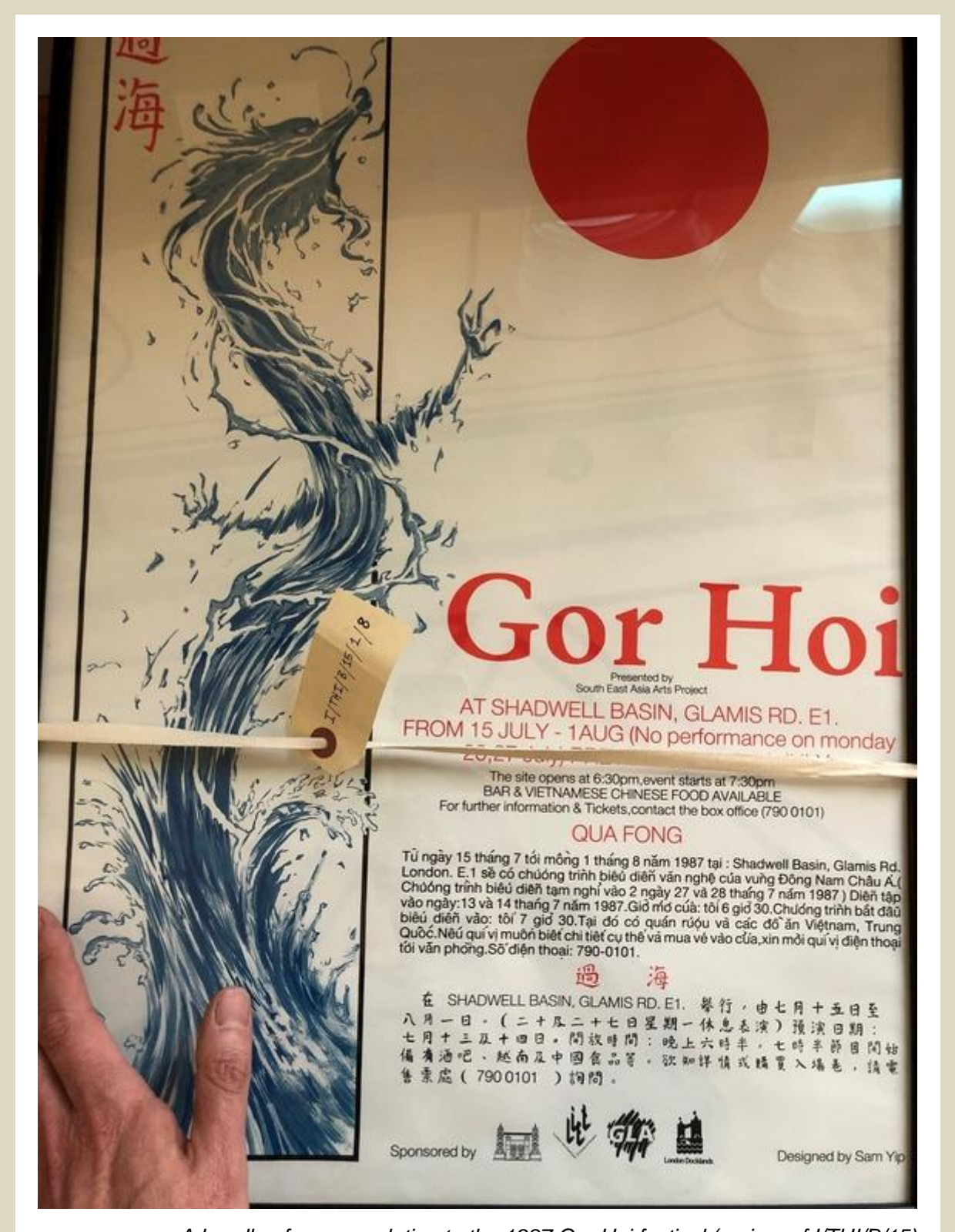
A bundle of papers relating to the 1987 Gor Hoi festival (series ref I/THI/B/15)