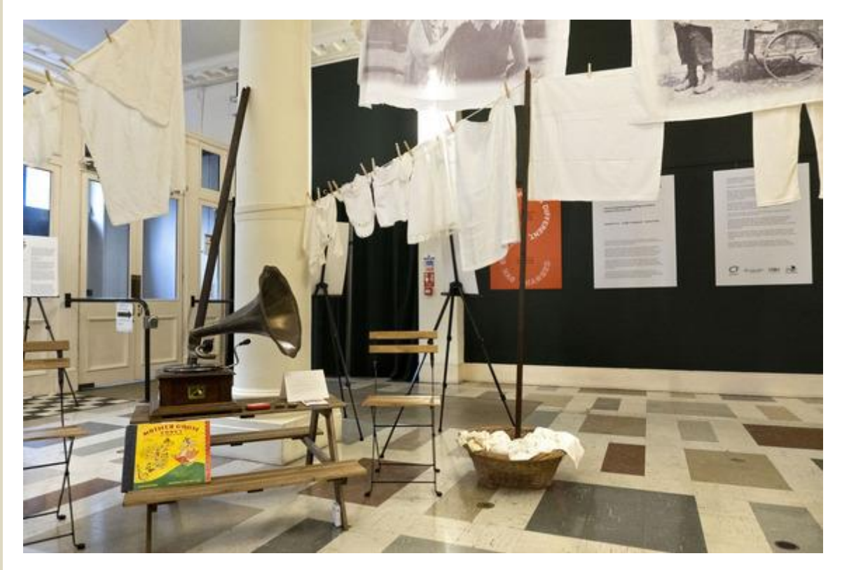
A partial view of Emily Peasgood's installation 'When We Were Young'.