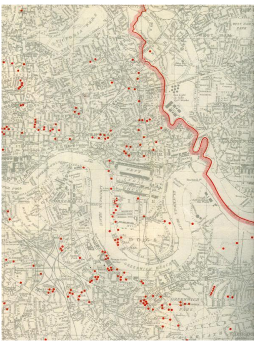
WW1 bomb damage map

For further information, please feel free to get in touch: perdita.jones@towerhamlets.gov.uk or call 020 7634 1290.