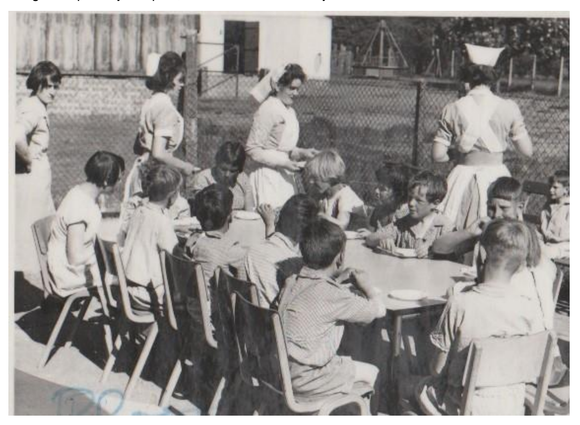
Image: Harperbury Hospital, late 1950s.

Tower Hamlets Local History Library & Archives is wheelchair accessible. Please let us know if you have access needs. Otherwise, just drop in, there's no need to book.