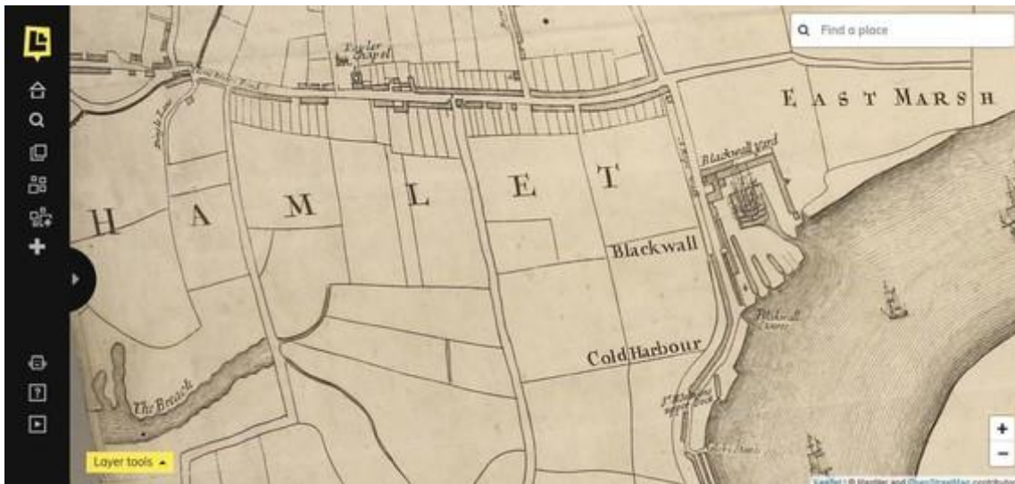
A section from a newly digitised 1703 map by Joel Gascoyne showing Poplar and Blackwall.

We're delighted to announce that the oldest maps in our collection have now been digitised and can be viewed online for free on the Layers of London website .