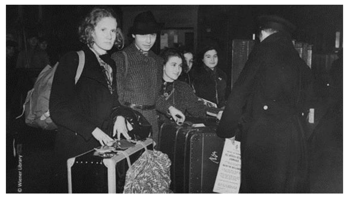
Children arriving at customs via the Kindertransport