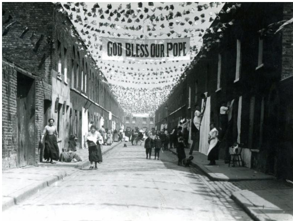
Preparing shrines in Rook Street, Poplar, in readiness for the Catholic procession, c.1920