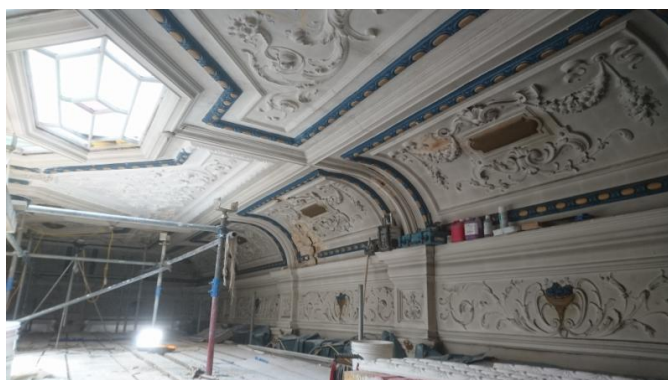
The hole in the ceiling has now been filled by a new plaster panel identical to the one that fell out. Its mould was cast from the facing panel on the opposite side of the skylight which was still intact.

On our initial survey of the reading room ceiling our surveyor unfortunately only had the luxury of a localised work platform and was hampered by the roof space void being totally covered in wood boarding and insulation material. Apart from the obvious section missing a large area of decorative plaster, the other areas requiring attention seemed to be several areas of loose flaking paint (which can be caused by modern paints being used over the original lime based paints) which was deemed to be part of the decoration package.