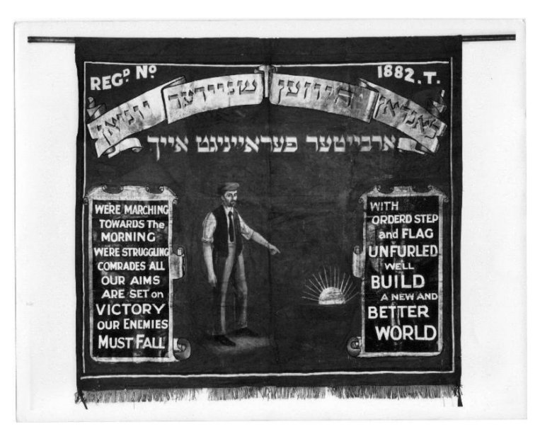
Banner of the London Trouser Makers Union formed in Whitechapel by East European Jewish immigrants

Rebel Footprints Author talk Thursday 30 April, 6.15pm