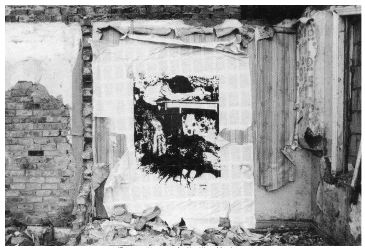
'Exhausted home worker' by Alison Marchant Outside installation, 1988.

here, or at an Idea Store, which features images from the exhibition such as the one below.