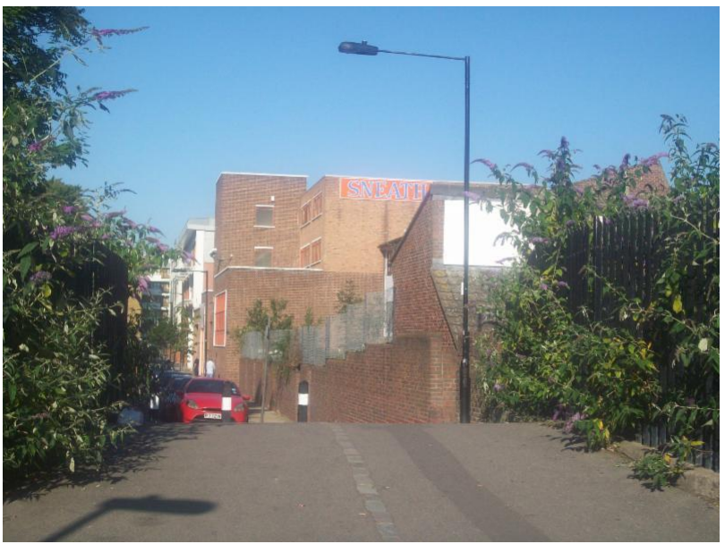
Sneath's factory in Solebay Street, Stepney, 2012

In-house, work is progressing on our own oral history project involving Sneath Engineers, a local company based in Solebay Street, Stepney. The project aims to capture a number of oral histories from the owners and employees of this long-standing family-run business which dates back to 1898 when it was originally located in Poplar. Two interviews have been undertaken so far and information about these recordings can be found on our catalogue (reference: O/SNT).