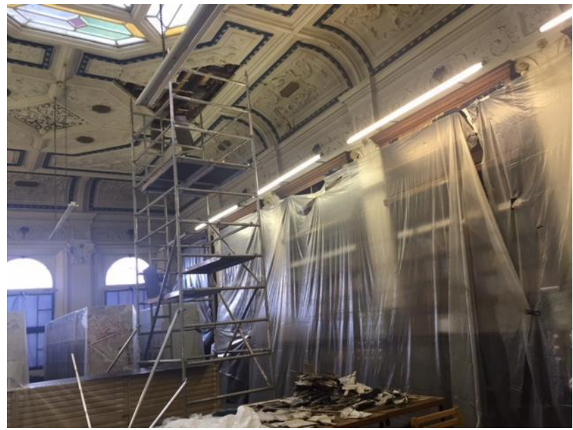
A scaffold tower has been erected to facilitate investigations of the damage to the ceiling. Shelving has been sheeted off to protect books from dust.