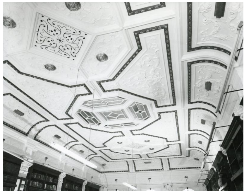
Tower Hamlets Local History Library & Archives reading room ceiling, photographed in the halcyon days of 1972