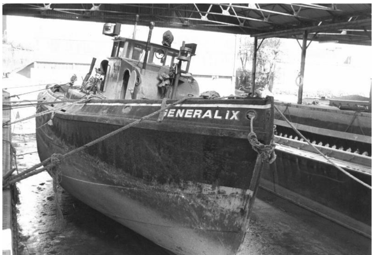
Thames and General Lighterage Co. repair yard at Brentford (photograph by Brian Liddle), 1970s

The Thames Festival Trust and the Museum of London are recruiting volunteers for an exciting history of London's boatyards, running from April to September 2017. The project will involve recording oral histories, and the production of a short documentary film. Volunteers will also be involved in researching the history of boatbuilding on the tidal Thames, which will form the backbone of a publication and series of exhibitions in September 2017.