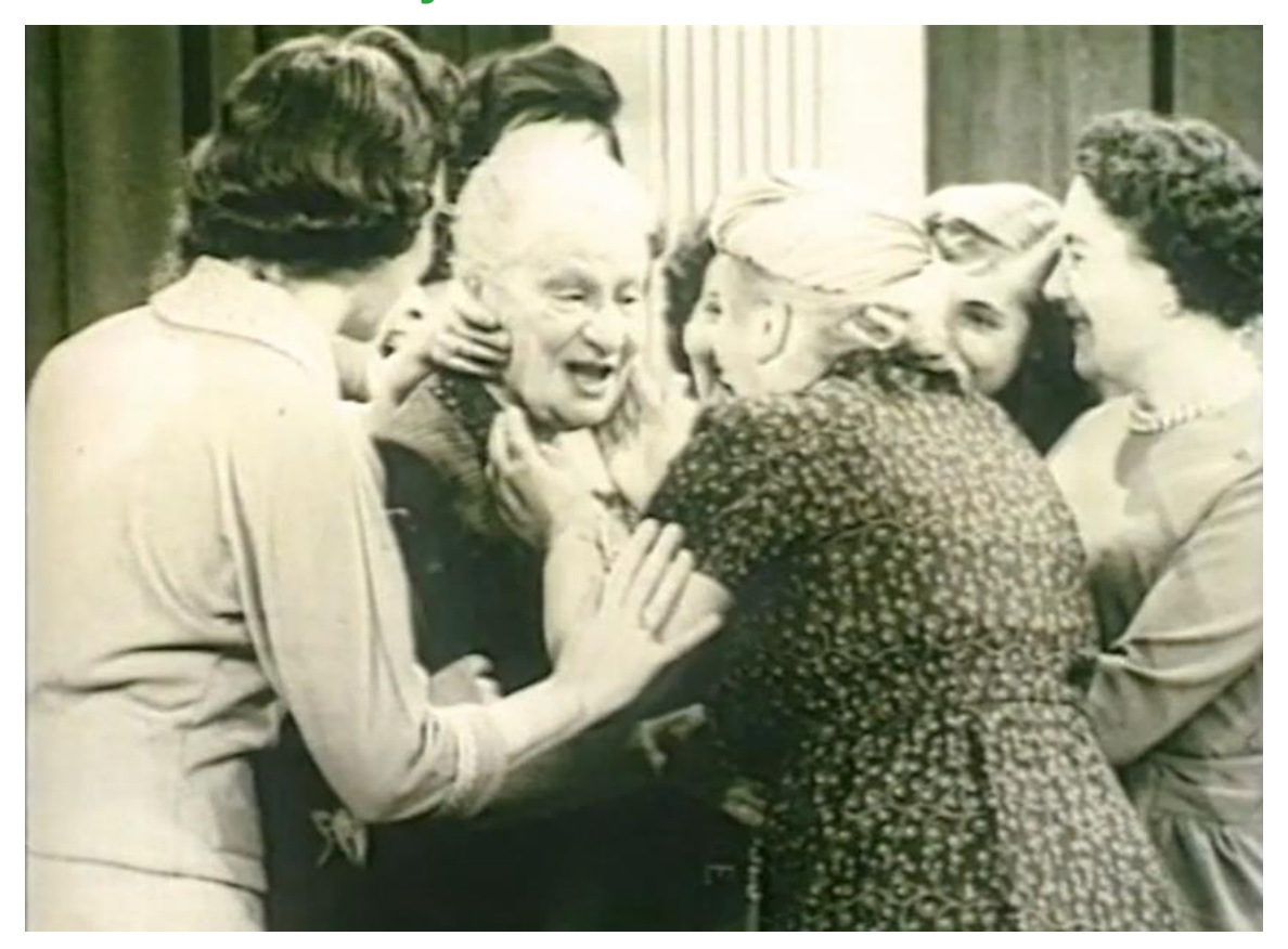
Film still from 'The Life and Times of Miriam Moses'