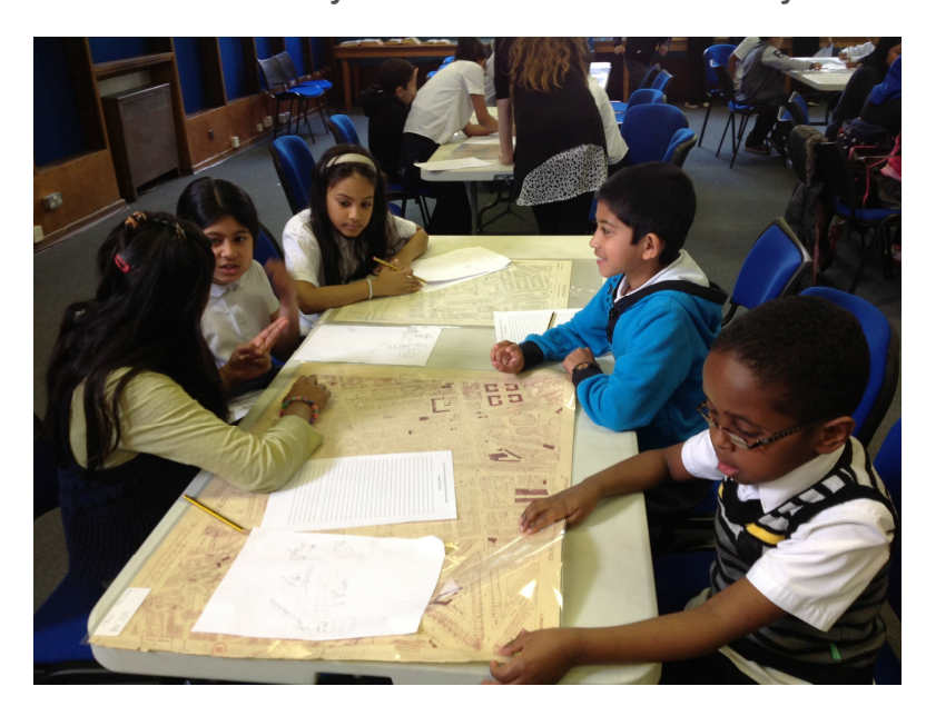
Children from Lawdale School explore historical maps and photographs