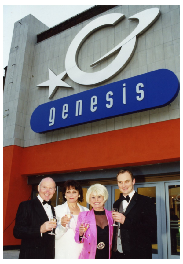
Opening of Genesis Cinema, Mile End, June 1999..

Please visit us if you are interested in studying the history of local cinemas, theatres and music halls.