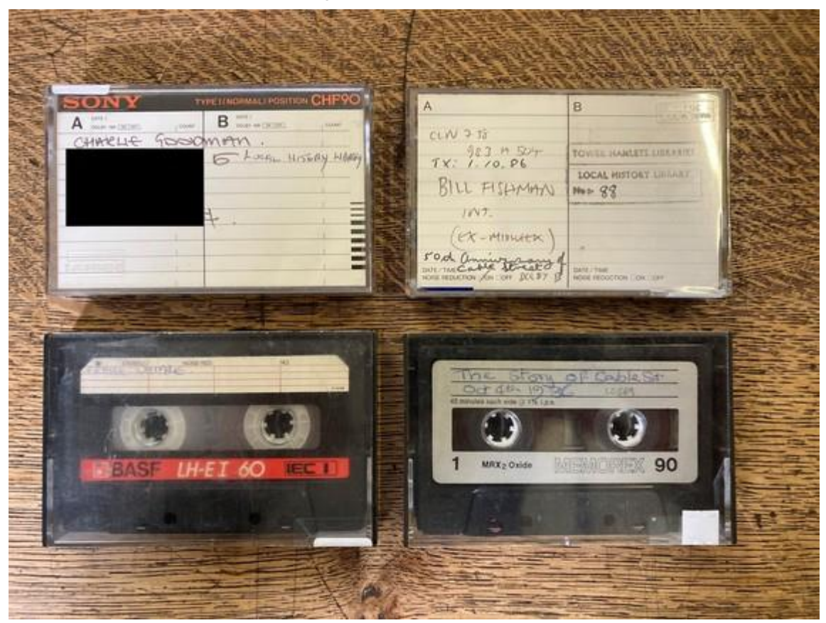
Some of the original cassettes on Jewish themes which have been recently digitised.

You can browse our sound collection by going to our online catalogue's <u>advanced search page</u>, selecting 'Audio' in the Type field, and clicking 'Search'. If a recording has been digitised it will include the statement 'A digitised public access copy of this item is available' in its Access Conditions field, and you can visit our Reading Room to listen to it on a computer.