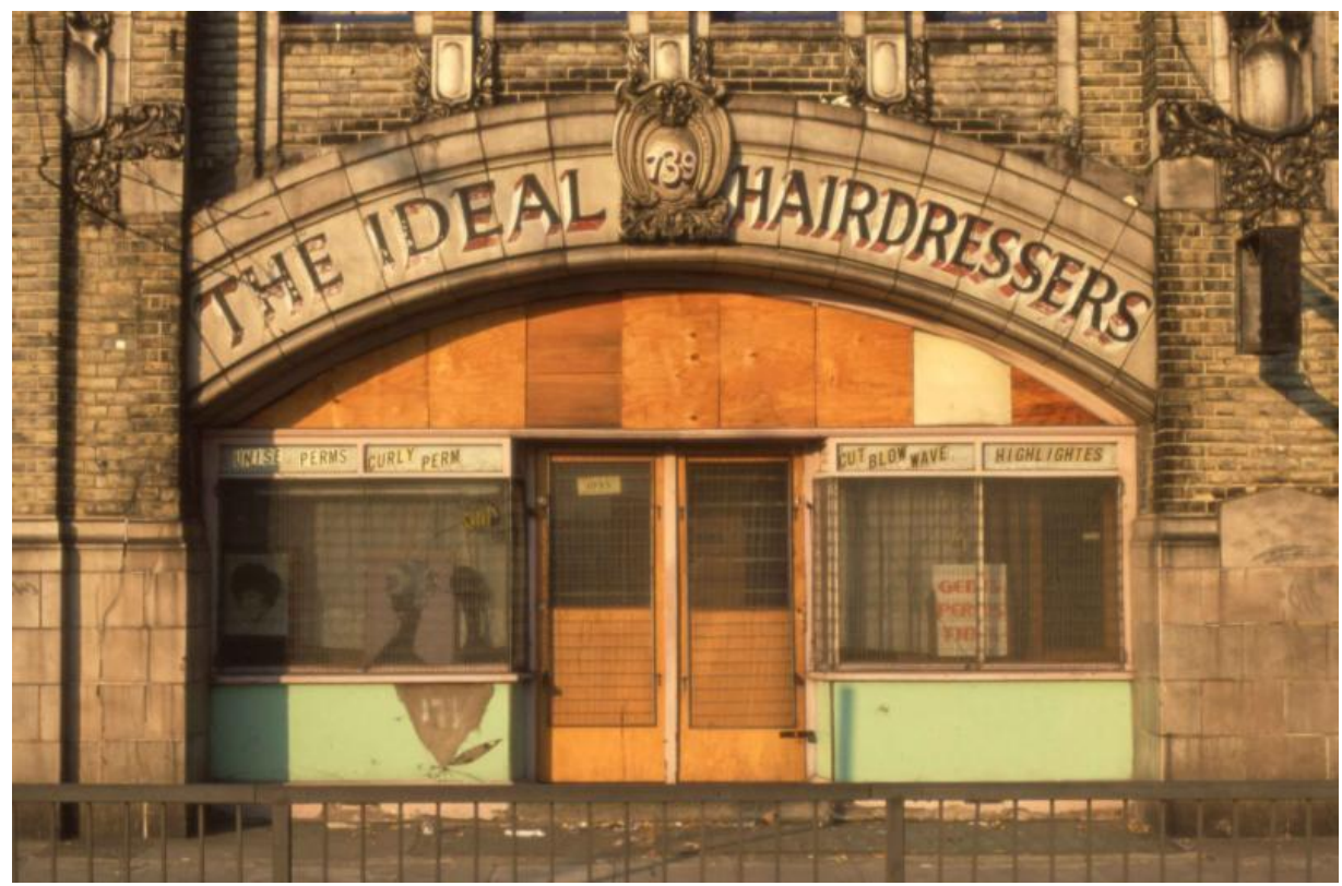
The Ideal Hairdressers, 739 Commercial Road, 1988, by Alan Dein