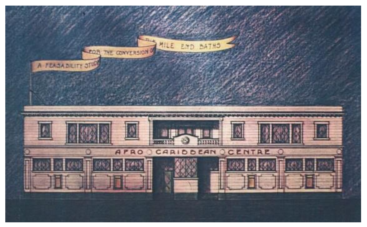
Campaign to convert the former Mile End Baths into a community centre, 1984.