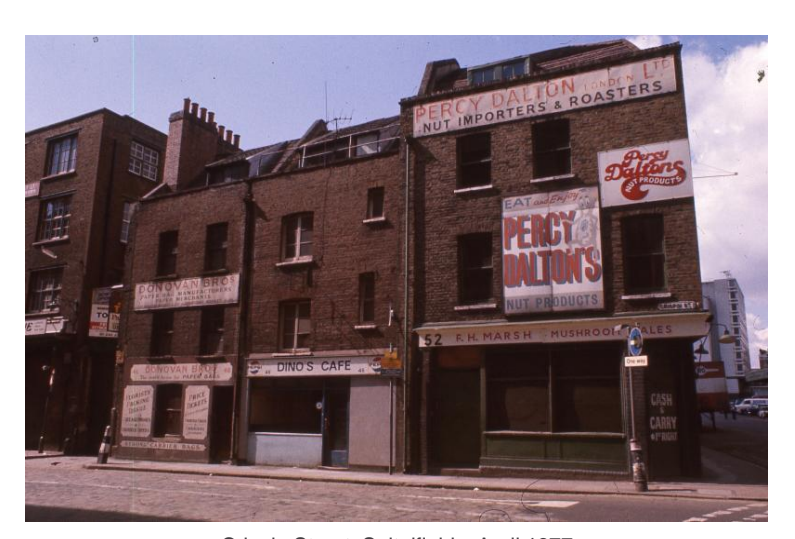
Crispin Street, Spitalfields, April 1977