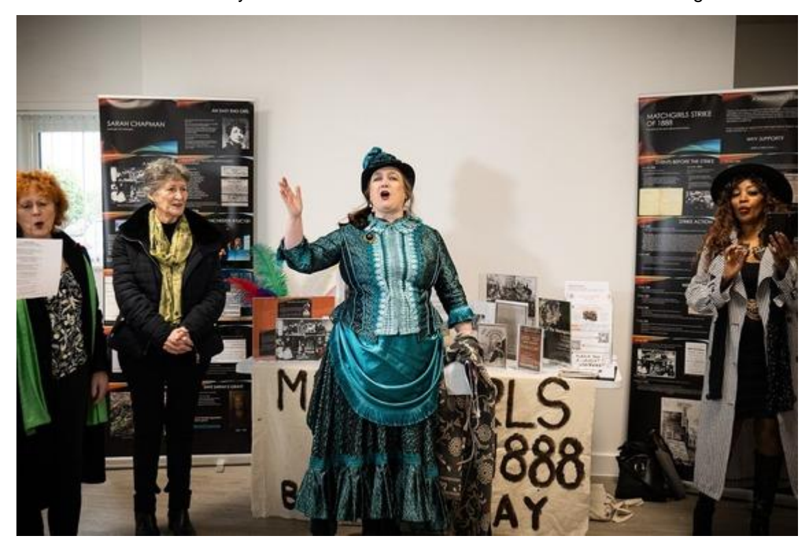
Attendees at the launch sang the Matchgirls' Song in unison

Sarah Chapman House has nine homes, which are a mix of 1, 2 and 3-bedroom properties, all with an external balcony. It has been built on the site of an old council housing office.