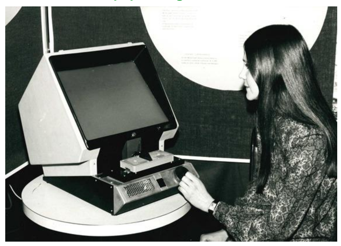
Cutting edge microfilm technology in use at Bancroft Library in 1973. Image ref no: P28621

All issues of the East London Advertiser published between January 1960 and December 1979 have now been digitised and are available to search in our Reading Room. Thanks to our new digital microfilm reader, these peerless repositories of East End local history are now fully searchable PDFs, and what once would have taken hours to find by trawling through bound volumes or reels of microfilm can now be discovered through a simple keyword search.